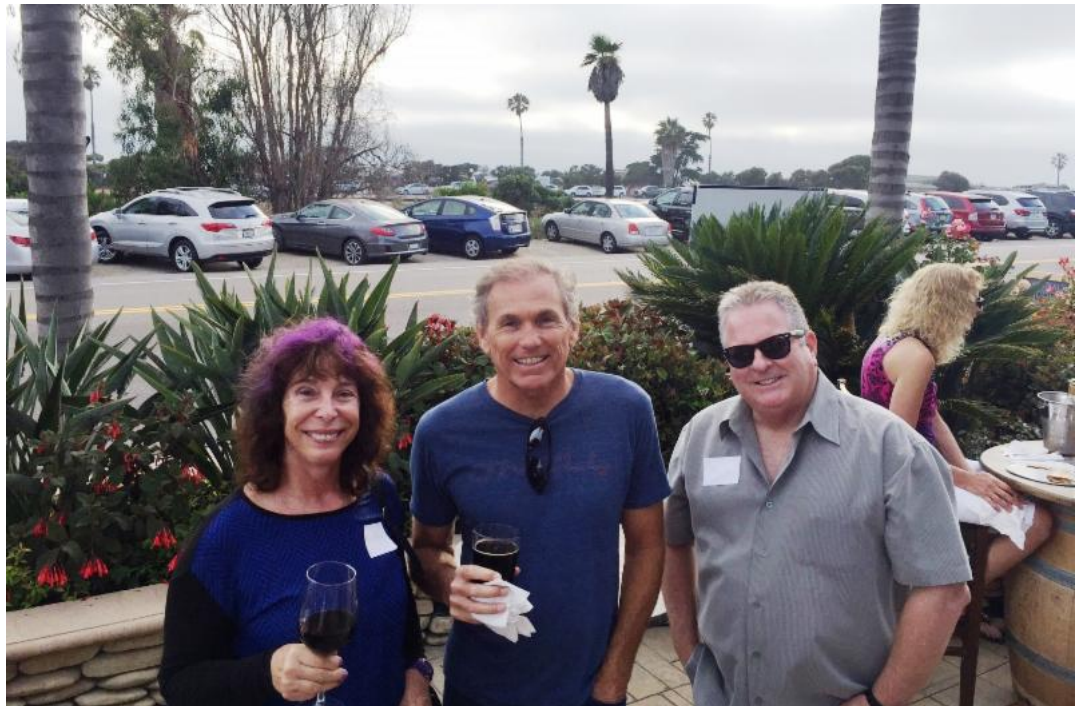
Very Happy Hour @ Wine Steals, June 20, 2017

Next Happy Hour & Meeting July 5th 5:30 PM Arterra, Del Mar