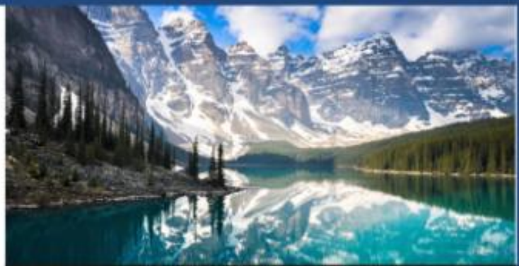
3 Ski Mountains - Canada's Yellowstone